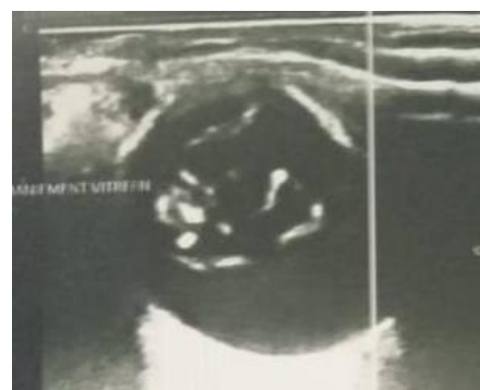
Figure 1: Ultrasound image of vitreous hemorrhage

The evolution was marked by the spontaneous resorption of the hemorrhage after one month with recovery of visual acuity to 9/10, without correction.