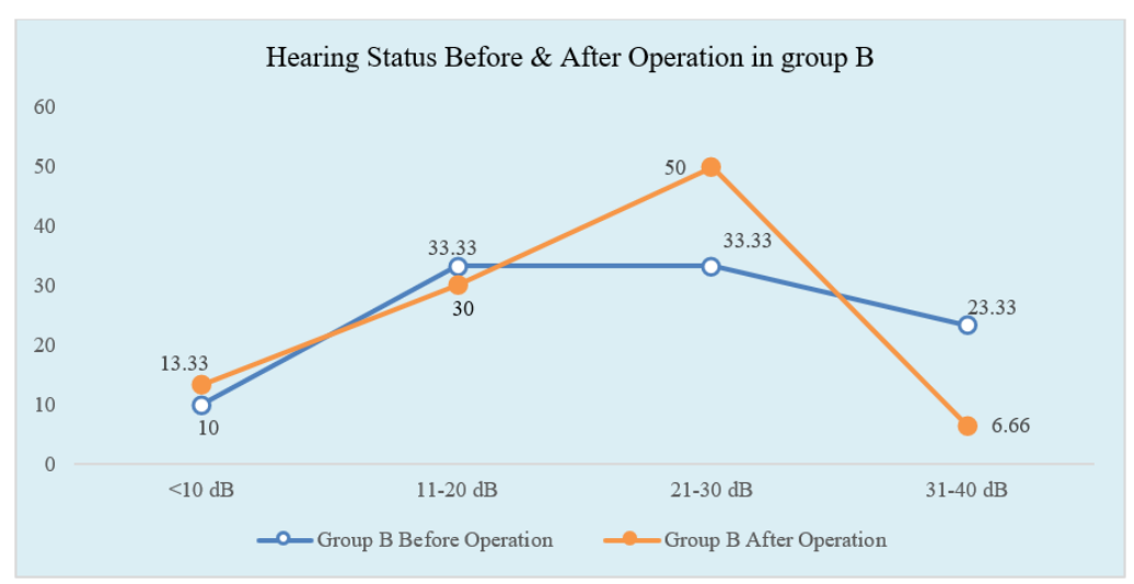
Figure IV: Line chart showed before & after operation hearing status in group A of patients (N=60)

Table VII: Complications of Surgery (N=60)