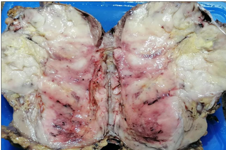
Figure 2 : Gross specimen : poorly demarcated heterogeneous mass with a peripheral border of the renal parenchyma