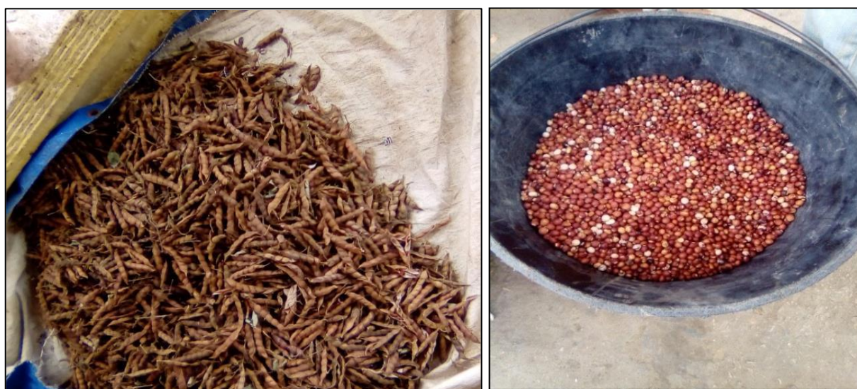
Figure 1: Post-harvest pods and seeds of the ICP7035 variety of Cajanus cajan .

Seeds of the ICP7035 variety were then processed into flour using an artisanal mill with a mesh diameter of around 4mm. The resulting seed flour was packaged and stored in 25kg bags until incorporation into the various experimental rations.