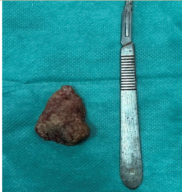
Figure 3: Image showing the surgical specimen