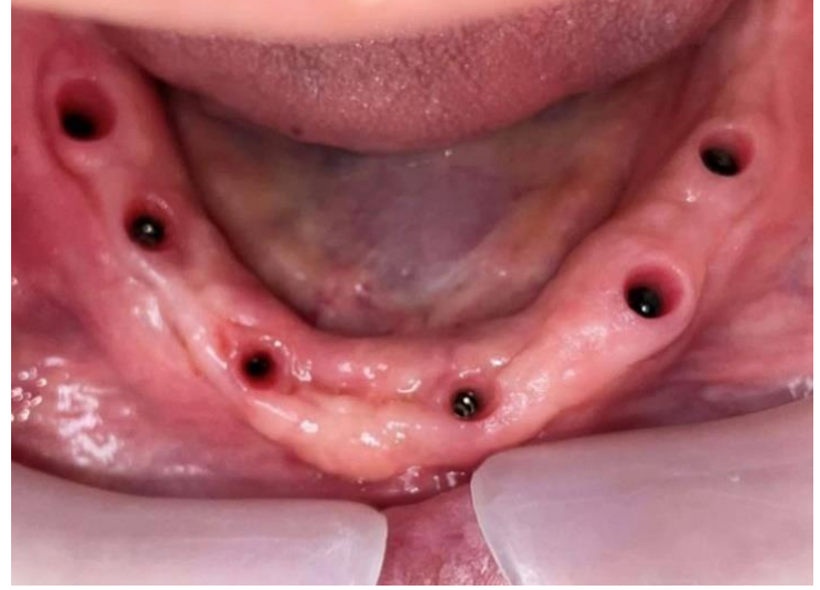
Figure 5: Three months after implants and healing abutments placement