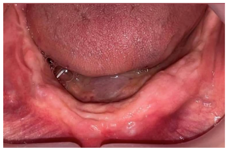
Figure 4: Endobuccal examination after 3 months

suture removal, then 1 and 3 months post-surgery with visual examination of the healing tissues for any signs of inflammation (Figure 4).