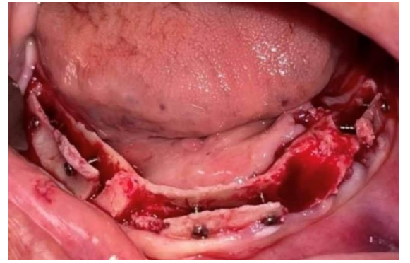
Figure 3: Surgical procedure

The lateral cortical plate was split and expanded by approximately 3-5 mm laterally using osteotomes. The space is maintained with fixation screws. The resulting space was sutured, allowing for blood clot formation between the separated bone plates, similar to a fresh extraction socket (Figure 3).