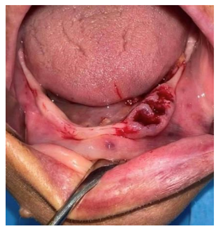
Figure 1: Endobuccal examination

A 57-year-old female patient was referred for fixed mandibular prosthetic rehabilitation involving dental implants. Clinical examination revealed persistent of only 33,34 and 35 teeth with a third grade mobility with pronounced labial and buccal bone resorption, classified as Lekholm and Zarb's class D atrophy (Figure 1).