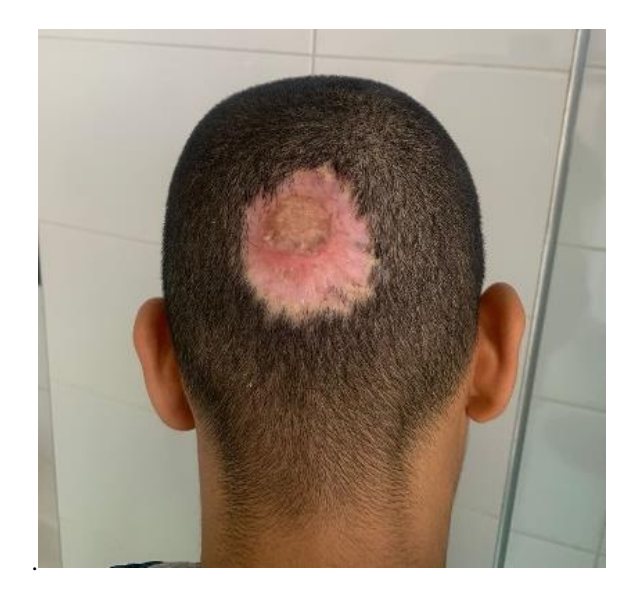
graft to cover the tissue loss and was referred to oncology for radiotherapy without the need for cervical clearance.

The histopathological result of the operative specimen showed clear margins between 1.3 and 1.6 cm. Subsequently, the child was scheduled for a thin skin