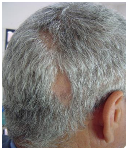
Figure 2: One-month postoperative photo of the patient with right occipital alopecia centered on the headpiece attachment points.

One month later, at follow-up, round hair loss was noted centered on the two occipital points of the headpiece fixation. The right measured 2 cm (Figure 2), the left 1.5 cm. Dermatological examination ruled out ringworm or underlying pathology. Three months later, the alopecia disappeared spontaneously without any treatment. The patient's personal hygiene was normal, with normal shampoos. No recurrence was observed after 48 months.