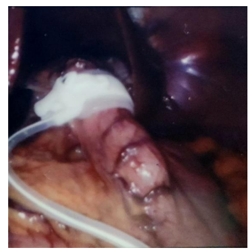
Figure 1: Gastric banding

This is a 35-year-old patient with no medical history other than maternal familial obesity who underwent laparoscopic adjustable gastric banding (Figure 1) 11 years ago for obesity (weight 92 kg, height 1.64, BMI 34.2) after failure of hygienic and dietary measures.