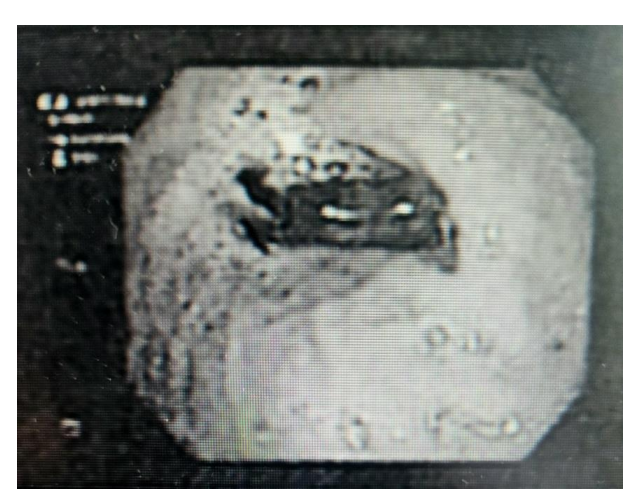
Figure 2: Fibroscopic view showing intragastric migration

Fibroscopy was ordered and showed complete intragastric migration (Figure 2).