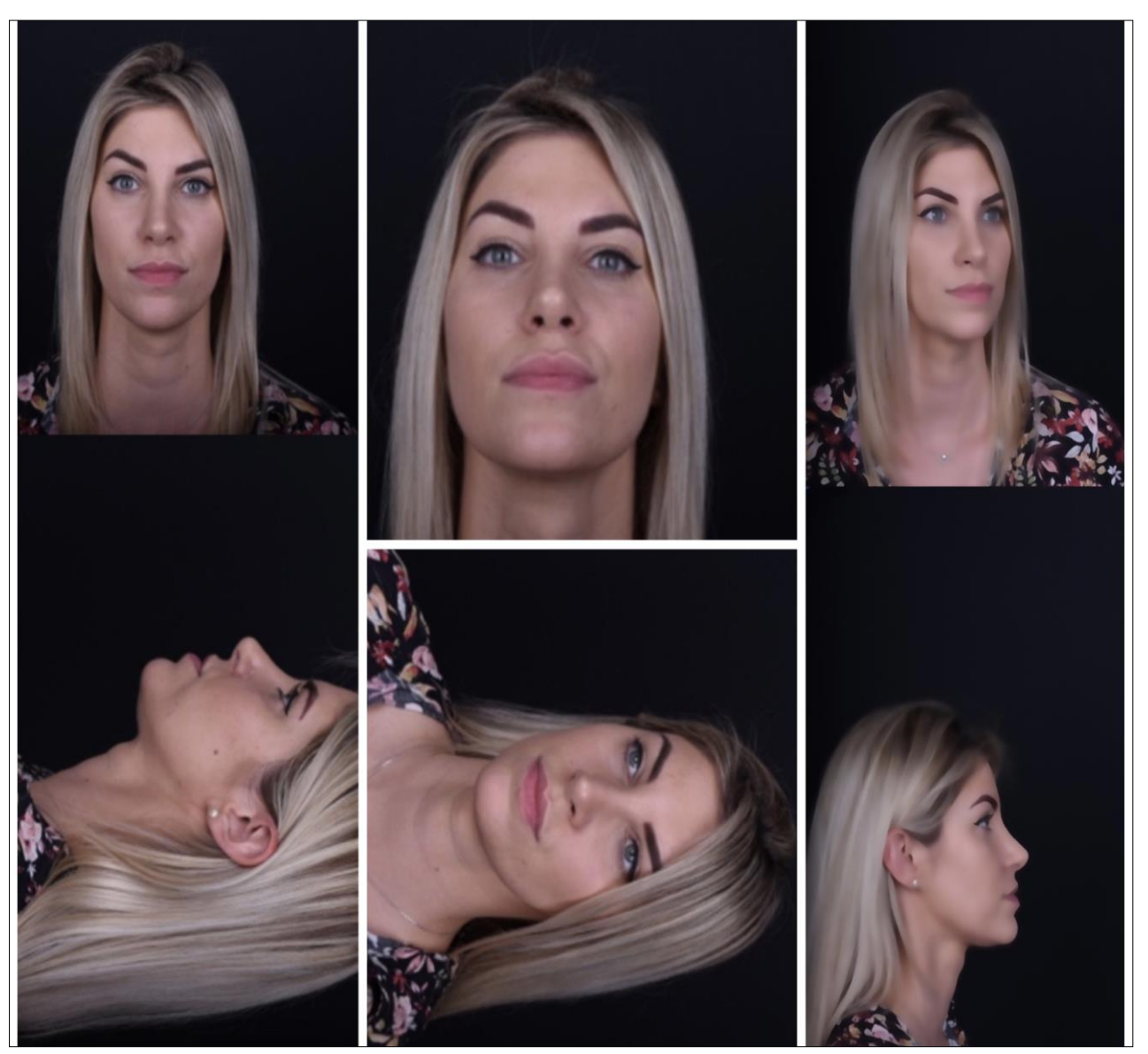
Figure 2: Different perspectives of the nose post-rhinoplasty with the piezoelectric system in Case 1