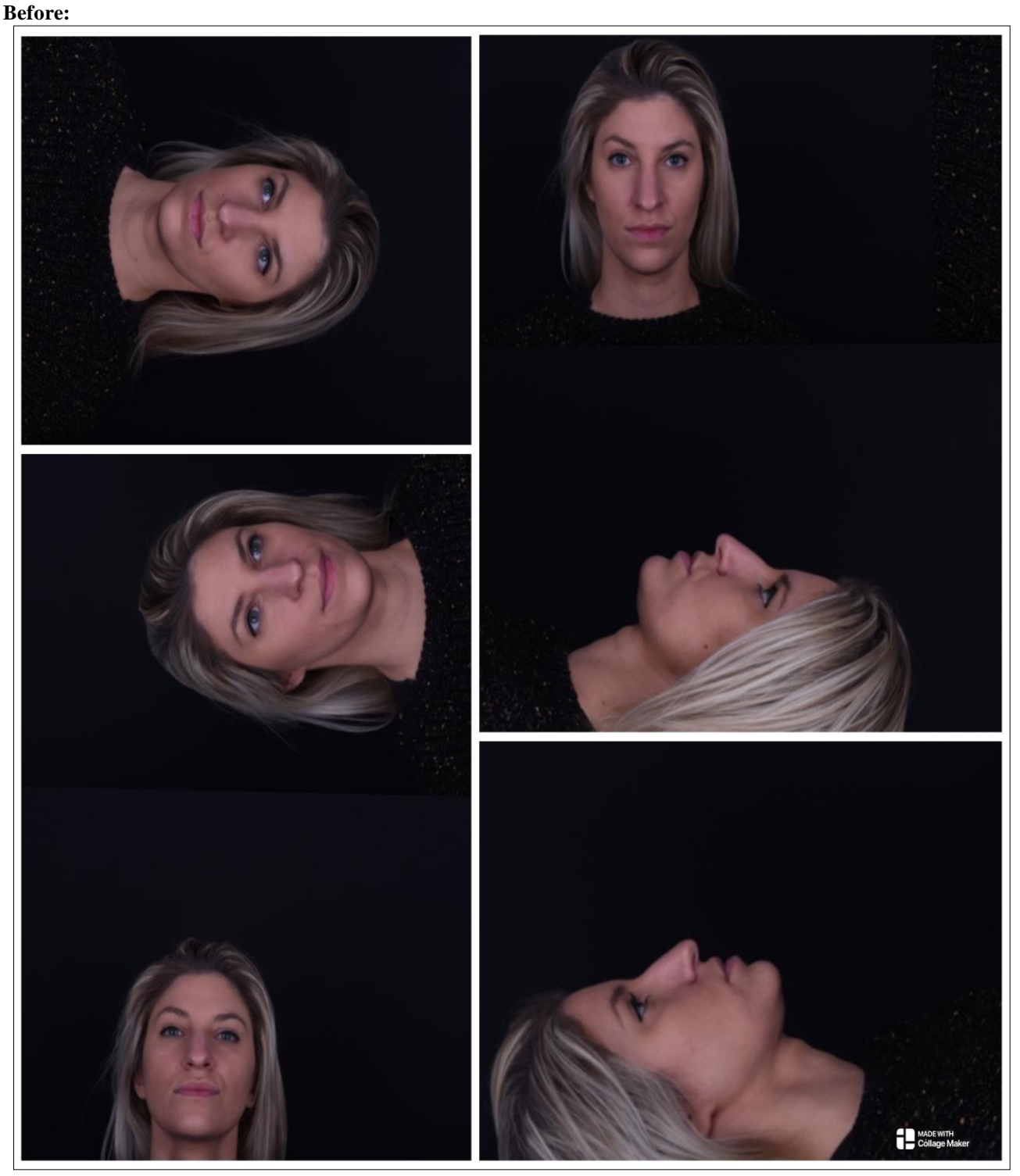
Figure 1: Different perspectives of the nose before rhinoplasty in Case 1

consent for the inclusion of their images/figures in this study, ensuring compliance with ethical guidelines."