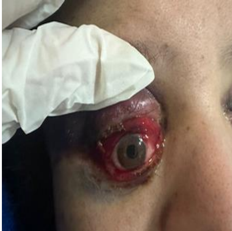
Fig.1 Ophthalmic examination at the admission

presentation, she was confused with a Glasgow Coma Scale (GCS) score of 14, but maintained stable respiratory and hemodynamic parameters. Clinical examination revealed marked right periorbital swelling, proptosis, eyelid edema, and hemorrhagic chemosis without conjunctival rupture (Figure 1). Visual disturbances and oculomotor impairment were suspected but difficult to assess. She also reported pain and complete functional loss of the right lower limb.