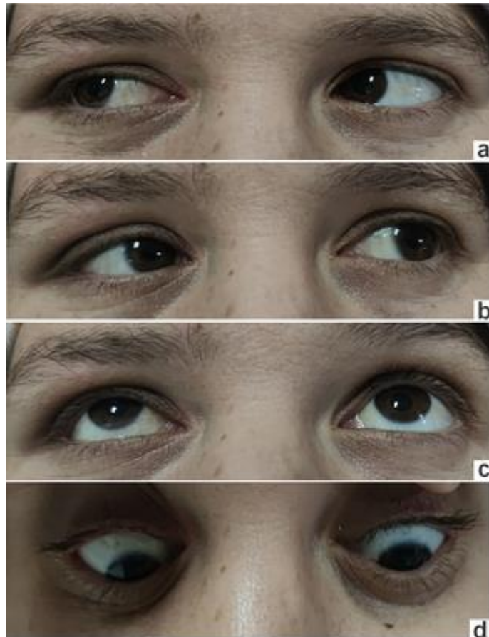
Fig.3 Ocular Alignment and Motility at Two-Month Follow-Up. It demonstrates preserved visual axis alignment and intact extrinsic ocular motility

The images depict voluntary eye movements in the rightward (A), leftward (B), upward (C), and downward (D) directions