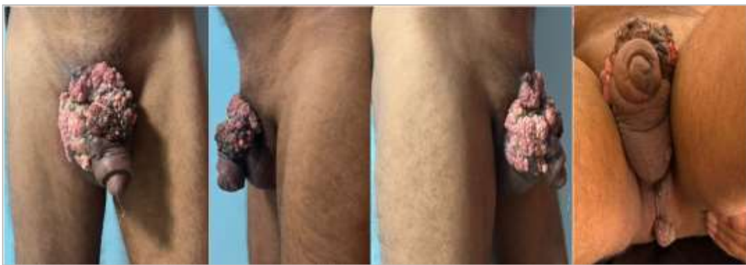
Figure 1: Buschke-Löwenstein tumor aspect with pubopenous and scrotal localization (pre-operative).

The evolution, with a 1 year delay, shows no signs of tumor recurrence. The patient has returned to normal sexual activity and is clearly satisfied with the results.