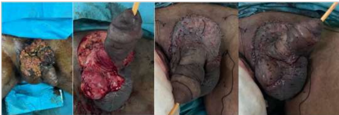
Figure 2: Tumour exeresis with thin skin graft coverage (per-operative)