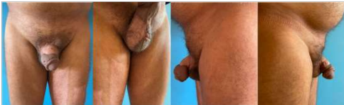
Figure 3: Follow-up of 1 year post-operative evolution