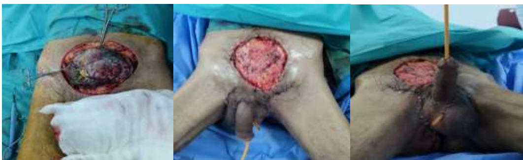
Figure 2: Tumoral exeresis with direct suture at the scrotal level (per-operative)