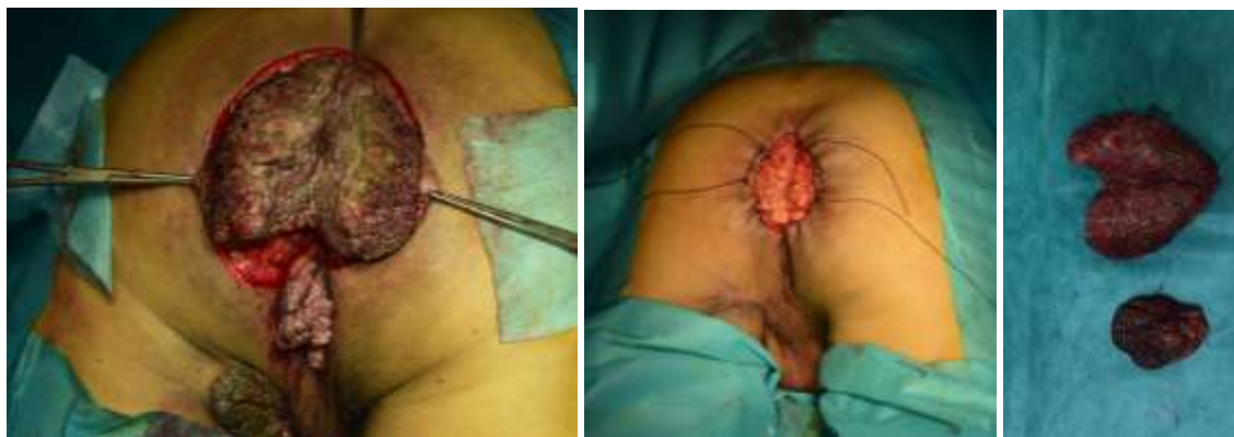
Figure 2 : Exerese tumorale (per-operatoire)