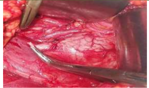
Figure 3: Ureter sectioned at stenotic zone and spatulated

MASIKA YALALA Dyna et al, Sch J Med Case Rep, Jun, 2025; 13(6): 1463-1467