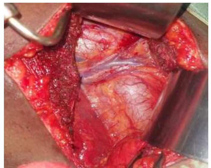
Figure 2: Lower polar vessel crossing the ureter with significant pelvic dilation