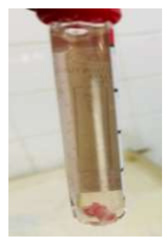
Figure 5: Resected ureteropelvic junction specimen