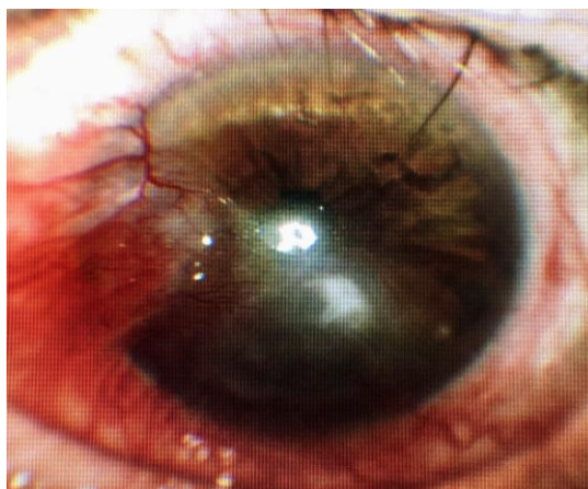
Figure 2: Photograph of the left eye showing a corneal abscess with neovascularization and pterygium