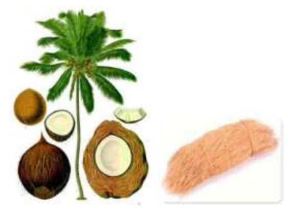
Fig-3: Coconut tree, coconut, coconut fiber