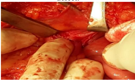
Fig-2: Releasing the adherent bowel by blunt dissection.