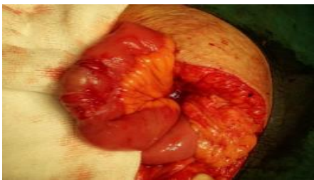
Fig-3: Viable bowel after complete release from adhesion.