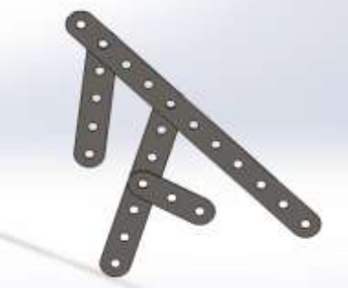
Fig. 3 Leg