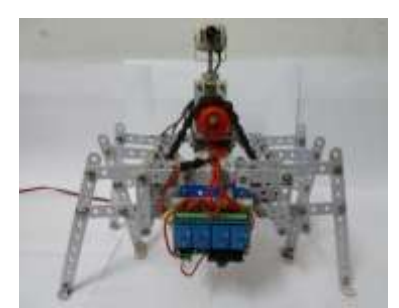
Fig. 5: Photograph of mechanical spider