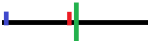
Fig-3: Timeline of the process, showing when process is being initiated and completed with the indication of new second

We need to maintain the balance between secure system and a system that can perform both encryption and decryption with in one second. Thus, we