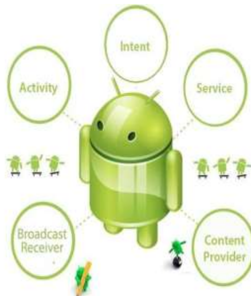
Fig-1: Android Components

Intents are delivered to the building blocks of logical application which are said to be the components of Android. There are four types of components which are defined by Android.