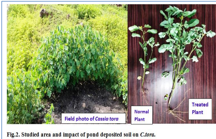
Fig.2. Studied area and impact of pond deposited soil on C.tora .

Our data was agreed with the previous literature, it was reported the pH of soil is one of the most important parameter and at basic or low acidic pH soils usually cultivated rice [22]. It was studied on the physicochemical parameters like pH, specific conductivity, chloride, total alkalinity, calcium, magnesium nitrate, sulphate, phosphate sodium and potassium from July 2008 to June 2009 and fluctuation were observed in several parameters [23]. It was reported that the salinity values above 2 dS/m begin to cause problems with salt sensitive plants, and values above 4 dS/m are problems for many garden and landscape plants [24]. Fungal diversity of any soil depends on a large number of factors of the soil such as pH, organic content and moisture [25].