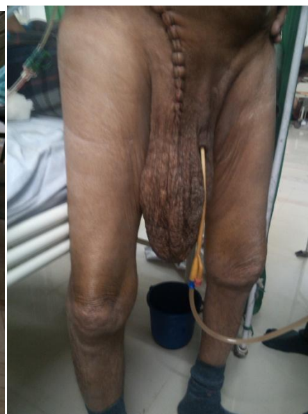
Fig. 2: Post-operative