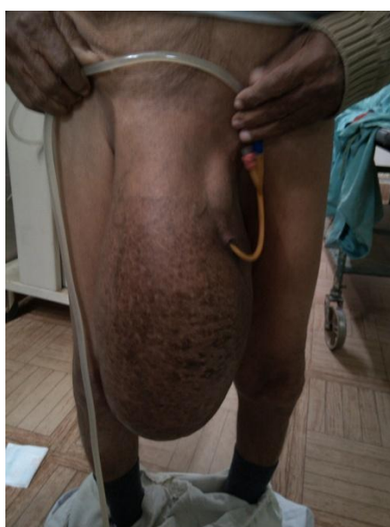
Fig. 1: Pre-operative

Postoperatively, the patient had continuing respiratory support in high dependency unit, with physiotherapy and scrotal support. Recovery was satisfactory with early return of bowel movement and mobilization. He had no significant postoperative complications and was discharged home with an indwelling urinary catheter on postoperative day 08.