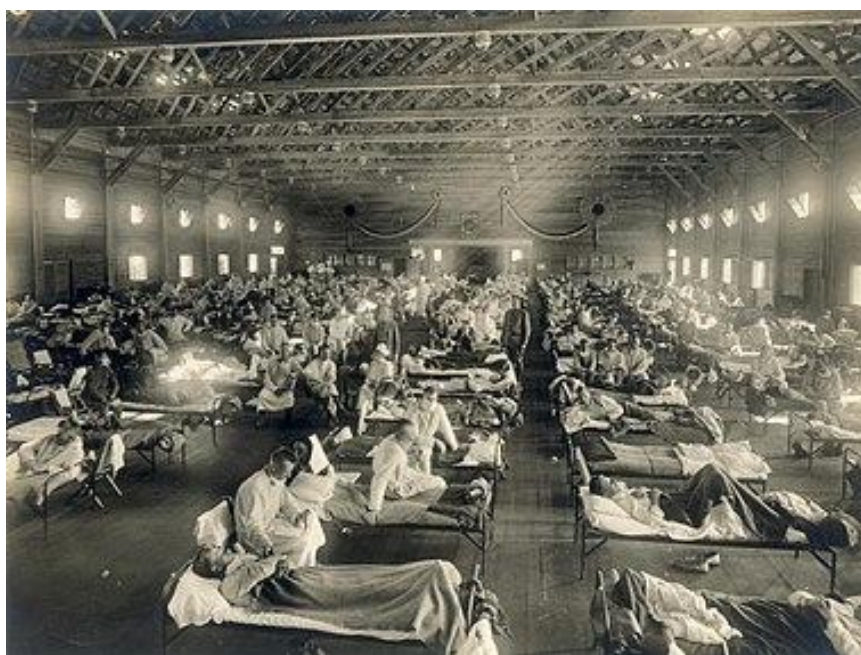
Emergency hospital during Spanish Influenza epidemic, Camp Funston, Kansas (1918-20)

The intent of human being in the process of modernisation and becoming supernatural power to conquer the world lead to disaster to the mankind. In the process failed to realise the facts of infections which can be pandemic and take the lives of kith and kin even in the yester years and now also in the 21 st century. In epidemiology, an infection is said to be endemic (from Greek ἐν εν "in, within" and δῆμος demos "people") in a population when that infection is constantly maintained at a baseline level in a geographic area without external inputs [1]. An epidemic is a disease that affects a large number of people within a community, population, or region. A pandemic (from Greek πᾶν, pan , 'all' and δῆμος, demos , 'people') is an epidemic of disease that has spread across a large region, for instance multiple continents or worldwide, affecting a substantial number of people. The most fatal pandemic recorded in human history was the Black Death (also known as The Plague), which killed an estimated 75–200 million people in the 14th century [2-7]. Other notable pandemics include the 1918 influenza pandemic (Spanish flu) and the 2009 influenza pandemic (H1N1) [8-10]. The 18 th , 19 th , 20 th and 21 st century were noticed with number of diseases transmitted with bacteria and viruses. These diseases were transmitted on pandemicity and caused calamities, the socioeconomic status shattered.