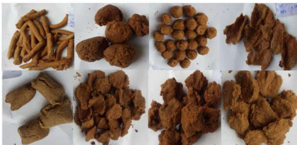
Fig-1: Different types of kulikuli) samples