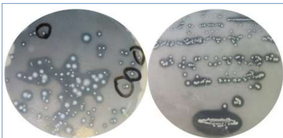
Fig-1: The isolation results of lactic acid bacteria from Papua red fruit ( Pandanus conoideus Lam.) on the MRS agar medium equipped with \text{CaCO}_3

compounds where dissolved calcium lactate (Ca-lactate) is produced [21]. The colonies with clear zones are then selected through phenotypic tests to determine the bacteria main character. Table 1 illustrates 25 LAB isolates obtained in the form of rods, Gram-positive, homofermentative, non-motile, and catalase-negative cells, grown at 10°C and 45°C, according to the digestive tract temperature range. These are the predominant bacteria traits [22], used in the selection of potential probiotics.