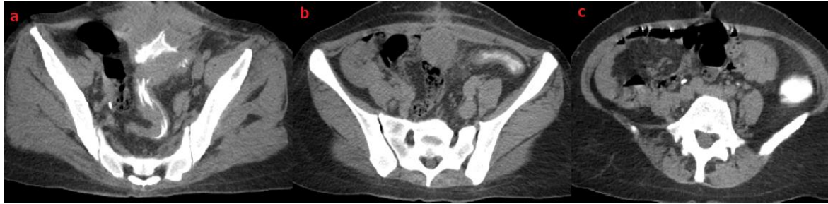
Fig-3: axial CT sections on delayed injection phase showing an opacification of the sigmoid extending to the descending colon indicating an urachal-sigmoid fistula