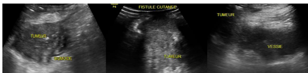
Fig-1: Ultrasound axial sections demonstrating the tumor arising from the bladder, with cutaneous fistula and close contact with the sigmoid

The patient underwent an anterior pelvectomy with resection of a 10 cm long sigmoid portion followed by a Bricker ureteroenteric anastomosis. Pathology confirmed the diagnosis of urachal adenocarcinoma with negative margins.