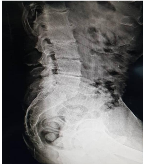
Fig-3: Lateral radiograph of the spine