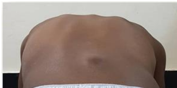
Fig-2: View of the patients showing smooth kyphosis of lumbosacral spine