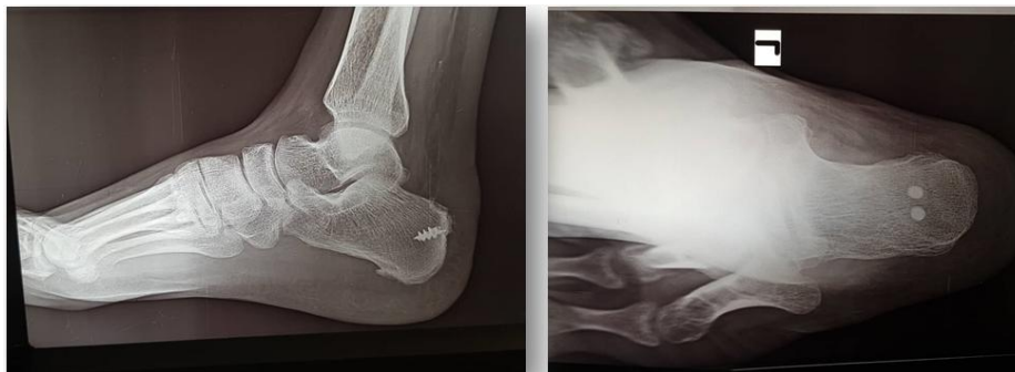
Fig-8: Postoperative radiographic picture of ankle (lateral and axial harris view) showing anchor