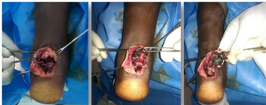
Fig-5: Intraoperative view showing black discoloration of the Achilles tendon