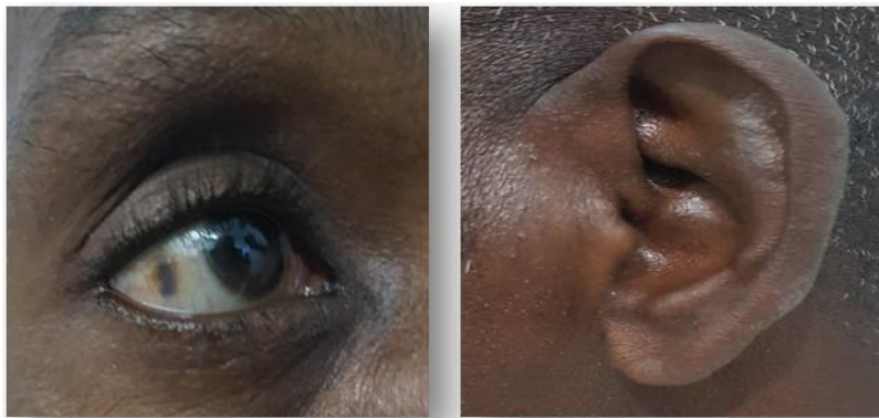
Fig-1: View of the patients showing black pigmentation on eye and ear

We start surgical intervention with the patient placed in a prone position, a skin incision (L-shape) was performed. The Achilles tendon found avulsed from it is the insertion and the tendinous portion of the Achilles tendon showed black discoloration (figure 5). A biopsy from black tissues at the rupture site shows fibrous tissue fragments with foci of degeneration and mixed inflammatory cells infiltration with the presence of brown/ochre pigment deposition (Figure 6). Approximately >1 cm of the discolored Achilles tendon was excised. The Haglund's deformity and was excised. The distal end of the Achilles tendon was also debrided. With the foot plantarflexed, the tendon re-attached to the calcaneus using two titanium anchors 0.5 mm under image control (Figure 7). Finally, a long leg cast applied with the ankle in plantar flexion and the knee in 30 degrees of flexion. Three weeks postoperatively, all sutures were removed and the skin incision was intact (Figure 8). However, the degree of plantarflexion was reduced weekly. In the fourth week after surgery, the ankle was in a neutral position and the patient could perform complete dorsiflexion and plantarflexion. After 2 weeks in a walking cast, active dorsiflexion exercises and full weight-bearing were allowed with walker boot.