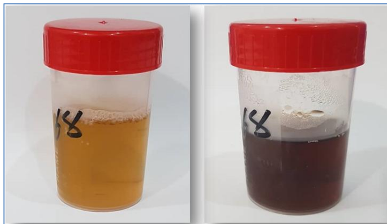
Fig-4: Urine samples from the patient: fresh sample (left) and upon standing for 24 hours (right)