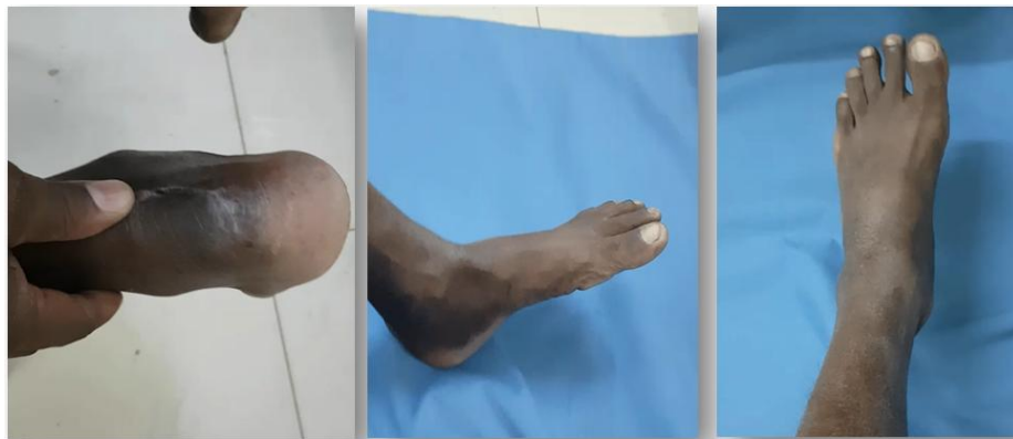
Fig-8: Postoperative photo shows postoperative intact wound and natural position of the ankle