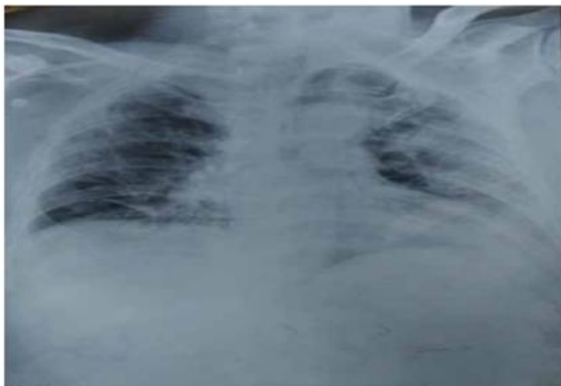
Fig-3: Chest X-ray report of the patients

cardiomegaly had found. The following figure is given below in detail: