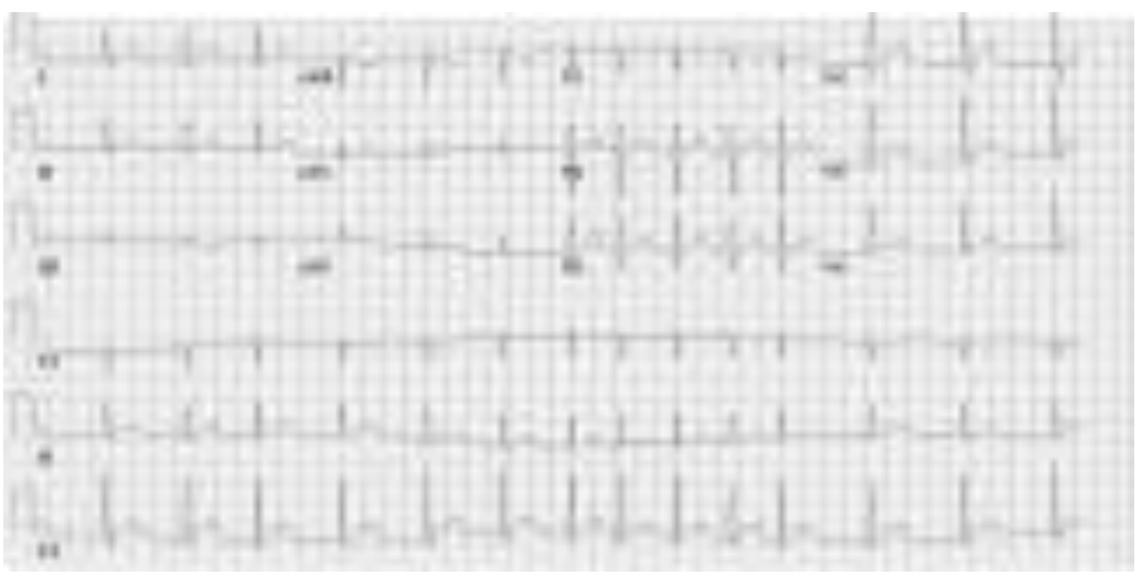
Fig-2: ECG for an atrial fibrillation's case