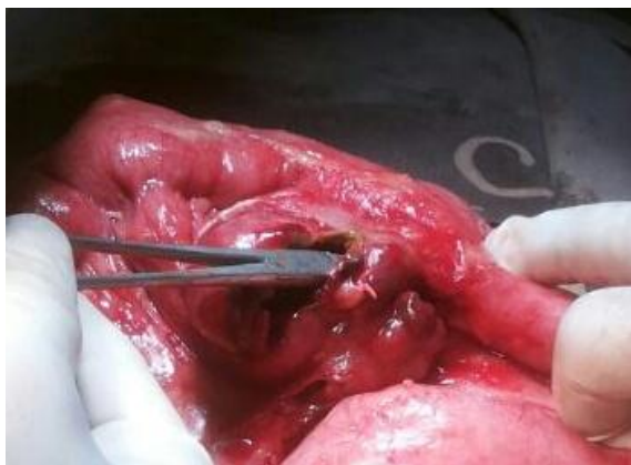
Fig- 2: GIST communicating with gut lumen