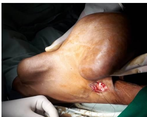
Fig-3: Image showing approach towards hilum of aneurysmal sac of arterio-venous fistula