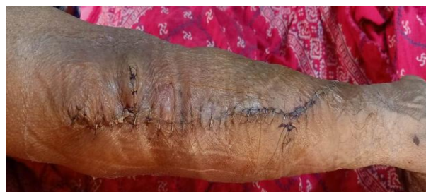
Fig-5: Image showing post operative recovery