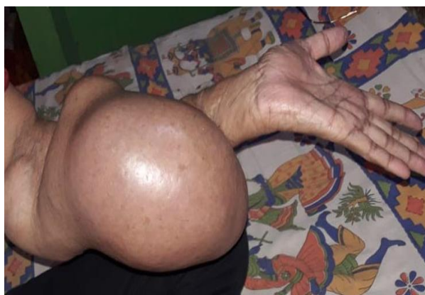
Fig-1: Pre-operative image on presentation

skin. Feeding vessel was dissected (Figure-4) and ligated before sac excision. Redundant skin was removed. Procedure completed in one hour and blood loss was about 50-60 ml. Per-operative period was uneventful. Patient recovered well with good cosmetic outcome (Figure-5) and presently on physiotherapy to gain maximum fore-arm function.