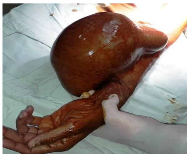
Fig-2: Image showing the huge size of the sac after draping