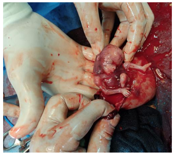
Fig-3: Fundal uterine rupture in 12-week pregnancy