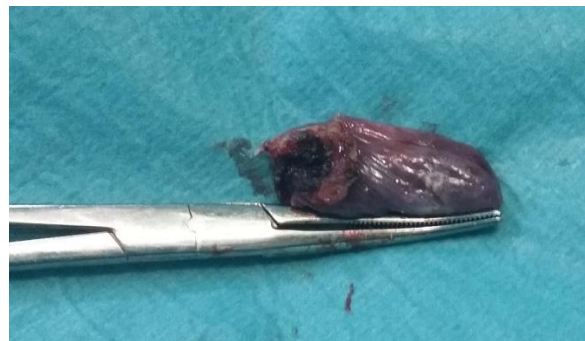
Fig-6: Image of the cyst after excision