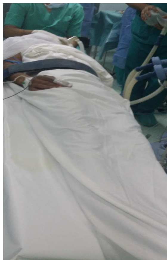
Fig-2: Patient's ventilation in left lateral position

A repeat direct laryngoscopy again using a Miller 3 laryngoscope blade introduced by a paraglossal approach and a flexible guide (Eschmann) to push the cyst aside has enabled intubation of the trachea after a brief although limited view of the laryngeal inlet. Finally, a 7-mm ID cuffed endotracheal tube (ETT) was railroaded over the flexible guide under direct visualization with the laryngoscope. The guide was removed, and patient was ventilated with oxygen-enriched air using an Ambu bag. Visible chest expansion on ventilation and bilateral breath sounds on auscultation confirmed that the endotracheal tube was correctly positioned in the trachea.