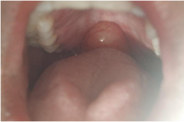
Fig-3: the vallecular cyst visible during “EEEEEE” phonation and tongue protrusion

A computed tomography (CT) scan of the neck imaging was done on the same day and showed an approximately 2 * 2.5 cm well defined cystic lesion arising from the right vallecula, extending into the oropharynx (fig. 4).