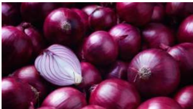
Scientific Name(s): Allium cepa Common Name(s): Onion