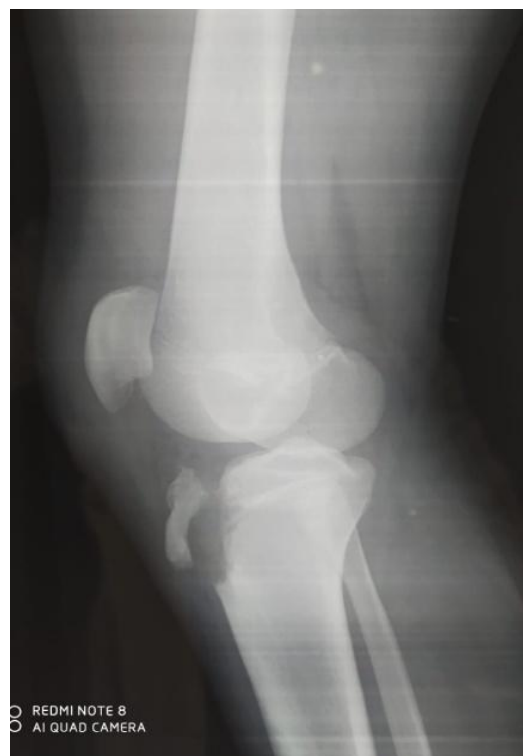
Fig-1: Emergency department X-ray in lateral view of the left knee

He is a 17-year-old teenager, with no particular history, presenting to the emergency department with severe pain in his left knee following a jump during a basketball game. Clinical examination revealed a painful swelling knee (Fig-1), with active knee extension deficit and unremarkable vasculo-nervous examination. X-rays of the knee, antero-posterior and lateral views revealed a tearing fracture of the anterior tibial tuberosity classified II A according to the Ogden classification (Fig-2).