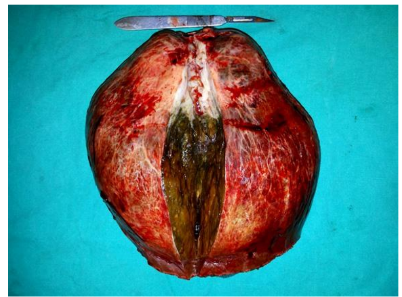
Fig-4: Cut section of the specimen

Histopathology confirmed hemangioma of liver. Post operatively the patient had an uneventful course and her symptoms were totally relieved. On 1 month and 6 month follow up, the patient was absolutely normal on the basis of physical examination, biochemical and radiological investigations.