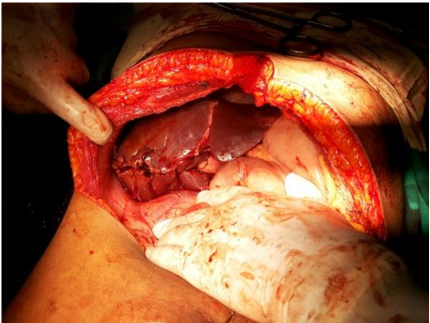
Fig-3: Suture of the defect in liver after wedge resection of the GHH

healthy liver tissue from Segment 5 and 6. The defect was primarily sutured with catgut over a surgical (Figure 3).