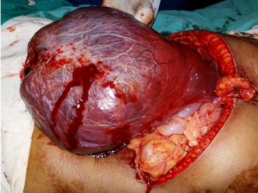
Fig-2--Delivering the GHH out of the abdomen

There was no infiltration in any adjacent bowel or great vessels. Cholecystectomy performed and a wedge resection of the exophytic growth was carried out by means of a harmonic scalpel taking a 2 cm