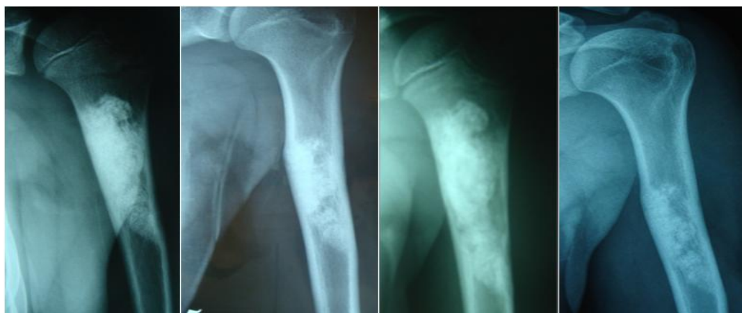
Fig-2: Evolution at 3 months, 1 year, 5 years and 7 years