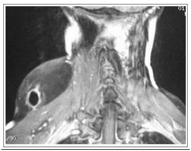
Fig-2: Coronal Fat-saturated T1-weighted image showed multiple prominent thick septa showed enhancement by gadolinium