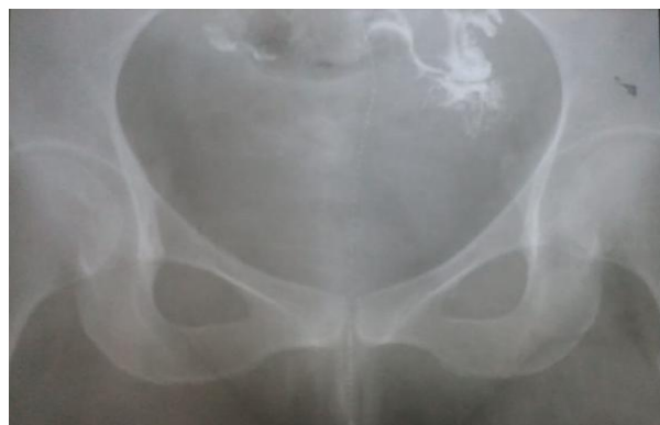
Fig-4: Tube filling phase