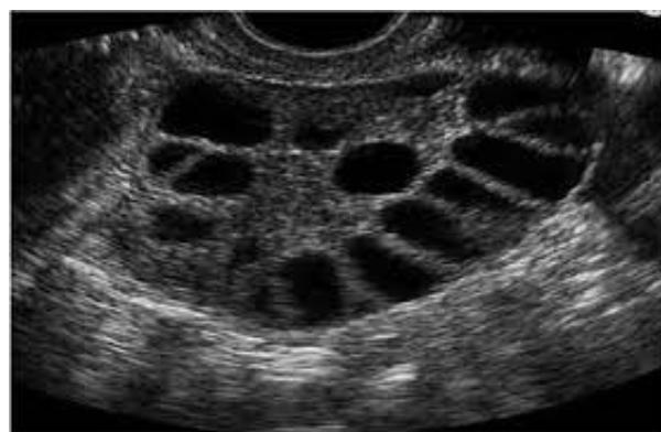
Fig-5: The Ultrasound image clearly revealing Multiple cysts i.e. PCOS