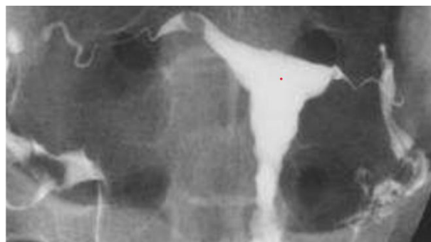
Fig-2: Hystero-gram showing Polyp in Right Fallopian tube

After explaining the procedure to the patient and taking her consent, hysterosalpingography was done. The patient was asked to empty her bladder and placed in a lithotomic position. The cervix was localized and after cleaning with povidone-iodine, a speculum was inserted. 10ml contrast was given (3ml to fill the uterine cavity and 3ml to fill the fallopian tube) which revealed the presence of polyp in the right fallopian tube (Figure-2). After the surgery, an antibiotic course of doxycycline was prescribed as prophylaxis to prevent any uterine infection.