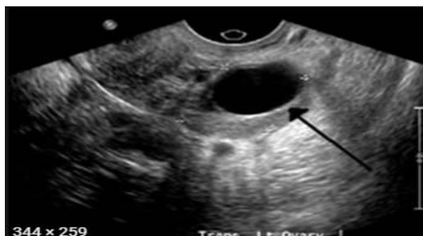
Fig-1: The Ultrasound Image showing, Enlarged Left Ovary

A 34-year-old married female patient presented with the chief complaint of infertility in Holy Family Hospital, Rawalpindi, Pakistan. She presented with the same complaint 7 years ago two years after getting married. She hadn't conceived before. After taking a complete history, it was discovered that her maternal side of the family had presented with a complaint of polycystic ovarian syndrome. She was a non-smoker and her blood glucose levels revealed that she did not have any diabetes. Her blood pressure was also normal at that time indicating that she was normotensive and there was no abnormality in her complete blood count report either. After doing an ultrasound, it was found that she had a slight increase in the size of the left ovary. As seen in patients with PCOS, the size of the ovaries becomes twice the size of normal ovaries (Figure-1).