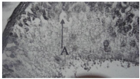
Fig-3: (10×40) epididymal duct epithelium A- Halo cells