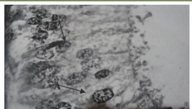
Fig-1: (10×100):- Oval shape of nucleus (B) of the principal cells (B)

Apical cells were located close to the luminal border of the epithelium. The nuclei of the apical cells located in the middle of the apical region of the cell. The basal cells were located along the basal border immediately interior to the basal lamina. The shortest stereocilia was found in the tail region.