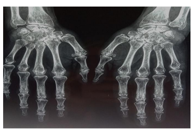
Fig-1: X-ray of both hands facing from the previous year showing geodes and erosions of both carpals, MCP, PPI and IPD associated with bilateral radiocarpal pinching

X-rays from the previous year had shown structural damage to both carpal, metacarpophalangeal, proximal and distal interphalangeal joints without demineralization or acroosteolysis (Figure-1). Current radiological assessment showed, in addition to the previous lesions, the appearance of resorption of the phalangeal tufts of both hands with subperiosteal resorption of the second phalanges of the hands (Figure-2).