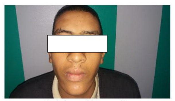
Fig-3: Acrofacial dysmorphia