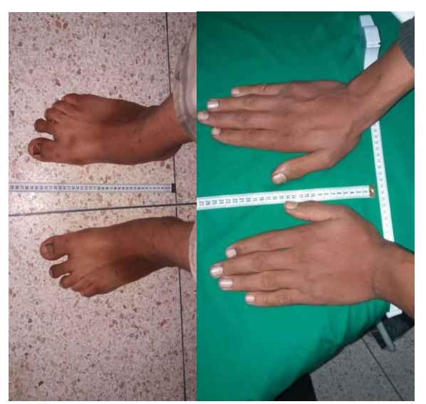
Fig-2: Bulging fingers and toes