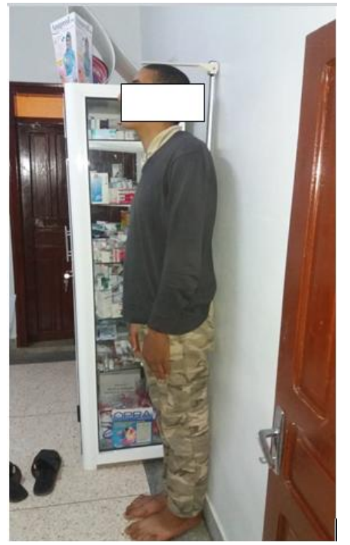
Fig-1: Patient gigantism