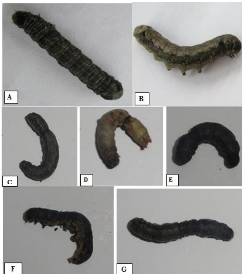
Fig-1: Failure of ecdysis of S. littoralis 5 th instar larvae after treatment with higher concentrations of Nerolidol. (A): Normal 5 th instar larva. (B) Normal 6 th instar larva. (C, D, E, F & G): Various symptoms of incompletely moulted 6 th instar larvae with old 5 th instar cuticles and abdominal constrictions.

Conc.: see footnote of Table (1). Develop.. Inter., a, b, c, d: see footnote of Table (3).