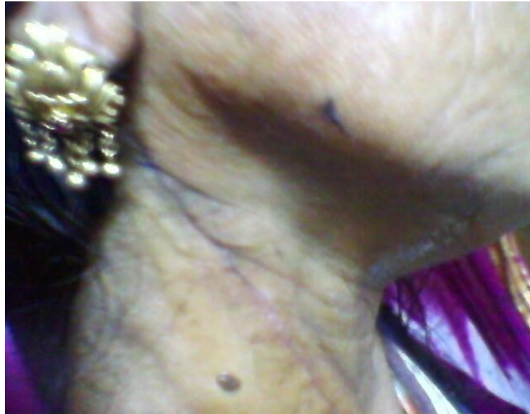
Fig-5: Intraoperative view: final result