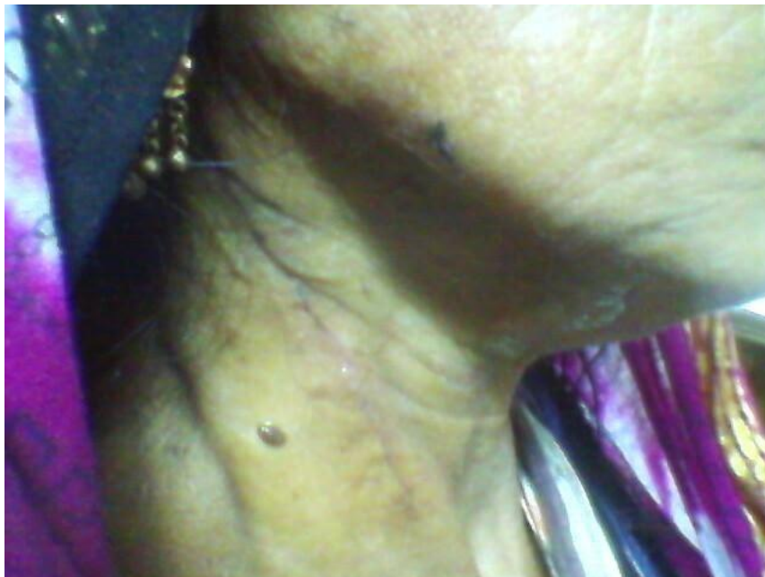
Fig-4: Intraoperative view: aneurysmectomy with Dacron- patch closure

wall, preserving the lumen of the native artery, thereby reducing the risk of injury to the vagal, recurrent laryngeal and glossopharyngeal cranial nerves (Fig 4 & 5). No adverse neurological events (focal or non-focal) were intra or perioperatively observed; pathologic examination of the aneurysmatic carotid wall revealed severe complicated atherosclerotic lesions. The patient was hospitalised for 4 days and discharged with anti-platelet therapy. One month, 6 months and 1 year Duplex Scan follow-ups were performed which showed patency of the carotid axis with regular blood flow. The patient appeared asymptomatic.