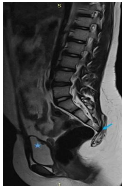
Fig-1b: Lumbar MRI (sagittal T2): Total agenesis of S4, S5 and coccyx (arrow) with diverticular bladder (star)