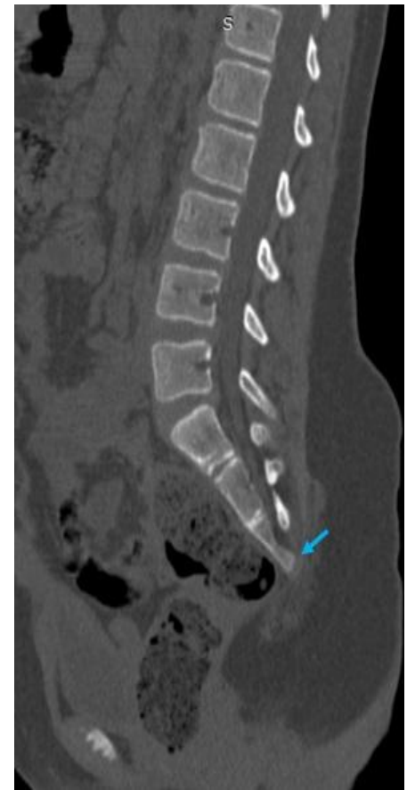
Fig-2: Lumbar CT in sagittal section: Total agenesis of S4, S5 and of the coccyx