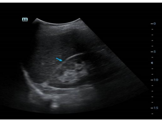
Fig-3b: Abdominal ultrasound: normal right kidney