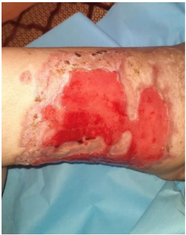
Fig-1: Pyoderma gangrenosum with undermined lesion of the righ thigh

pulses were weak. Cardiac auscultation revealed a 3/6 pansystolic murmur radiating to the back, with enhancement of the second sound. He had no signs of Congestive heart failure.