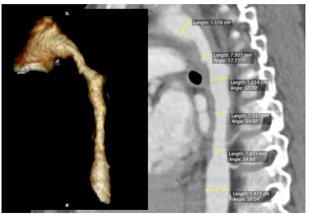
Fig-4: 2D and 3D CT angiography: oblique sagittal reconstruction showing long irregular stenosis of the descending aorta

anomalies. The diagnosis retained was atypical aortic coarctation caused by Takayasu's arteritis