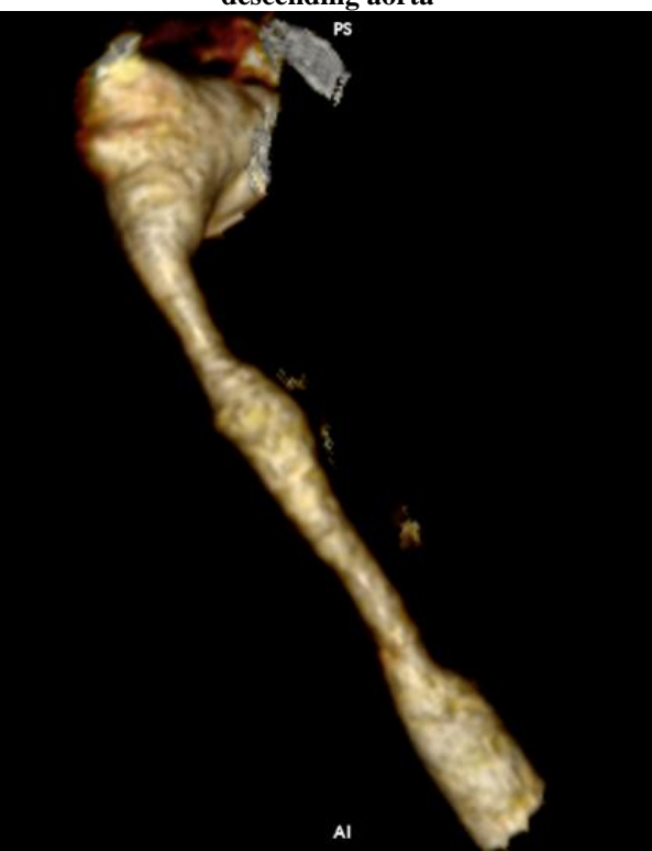
Fig-5: CT angiography: 3D reconstructing showing the long-narrowed segment of the descending aorta

During his hospitalization, the patient was treated with oral prednisone 40mg per day, amlodipine 10 mg per day and a beta-blocker type atenolol 50 mg per day. His blood pressure was well controlled after 5 days dropping down to 130/84 mm Hg in the right arm and 113/83 mm Hg on the left side.