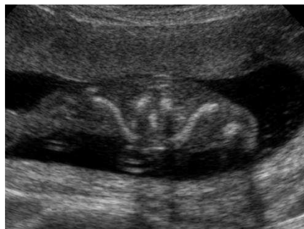
Fig-3: Bilateral Clavicles