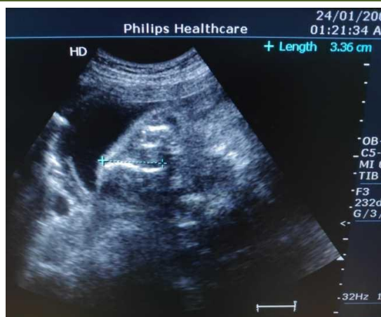
Fig-2: Ultrasonographic measurement of Clavicular Length as seen using curvilinear transducer