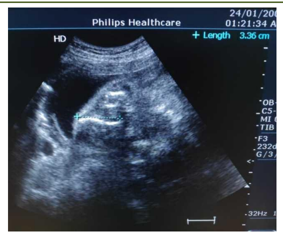
Fig-2: Ultrasonographic measurement of Clavicular Length as seen using curvilinear transducer