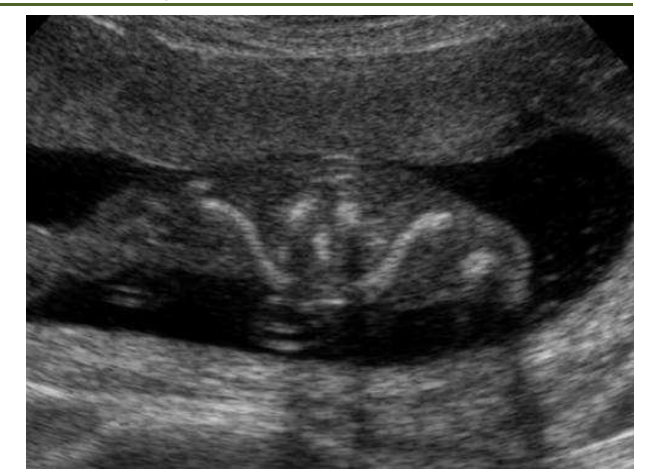
Fig-3: Bilateral Clavicles