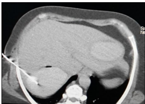
Fig-3: CT scan emphasised simultaneous Gharbi type I hydatid cyst treated subsequently by double PAIR with cystography. Cysts located in segments VII and II of the liver