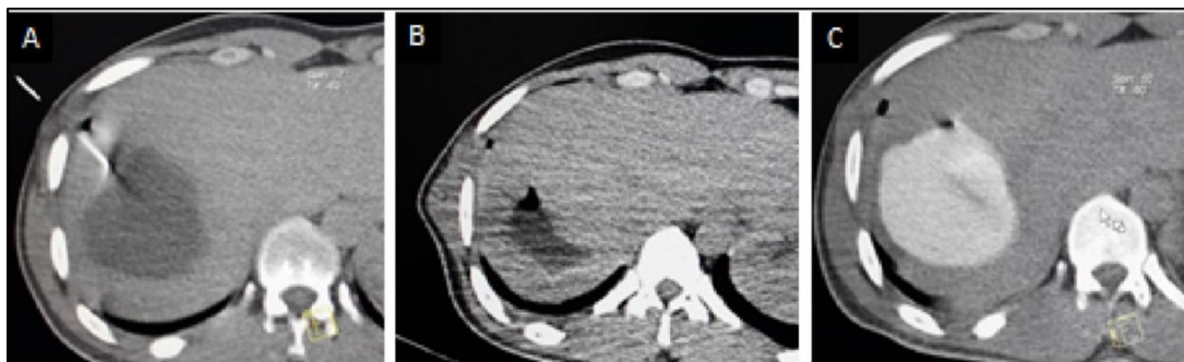
Fig-2: Axial CT slices of the liver of 41 years old woman with Gharbi type I hydatid cyst located in segment VII, treated by double PAIR: (A) Puncture. (B) Aspiration. (C) Injection of hypertonic saline serum with cystography to be sure that there is no biliary fistula