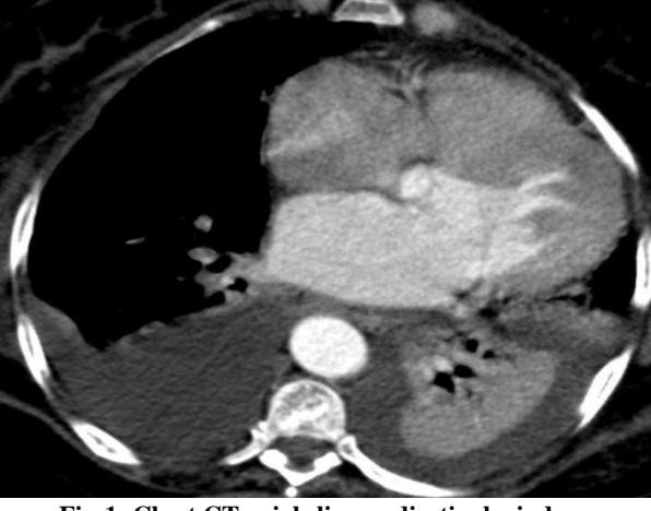
Fig-1: Chest CT axial slice mediastinal window: abundance of pleural and scissural effusion on the left and moderate abundance on the right with atelectasis of the left lower lobe

However a chest angio-CT scan shows low abundance of pleural and scissural effusion on the left and moderate abundance on the right with atelectasis of the left lower lobe (Figure-1), pulmonary consolidation with aeric bronchogram scattered at the apex and lingula (Figure-2). Individualisation at the ventral segment of the culmen a tortuous dilatation of an intrapulmonary vein flowing into the left superior pulmonary vein (Figure 3 and 4).