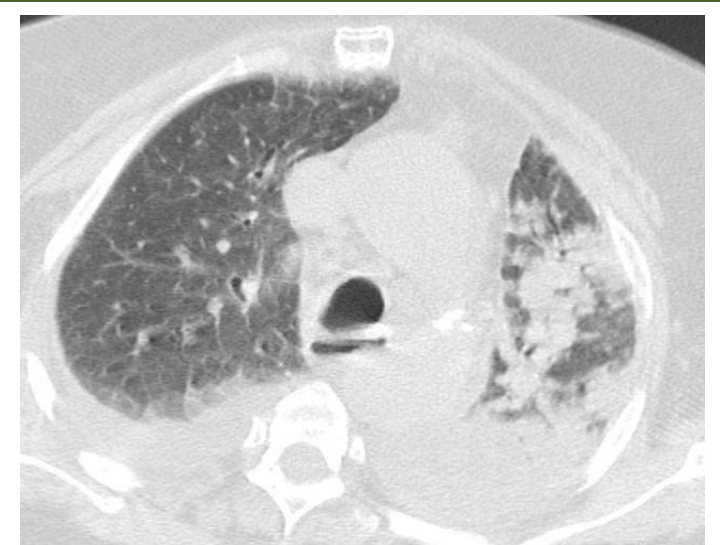
Fig-2: Chest CT axial slice window parenchymal window: consolidation with aeric bronchogam scattered at left apex and lingula