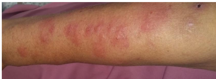
Fig-1: Right forearm photography showing multiple erythematous papules with vesicles at the center

A 67-years-old female patient presented to our dermatology department with the chief complaint of itchy erythematous papulo-vesicular lesions located on her face and extremities evolving since one month. It was stated that an erythematous rash appeared two months ago accompanied with asthenia and weight loss. No history of insect bites or medication was found.