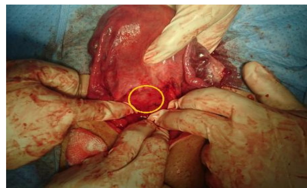
Fig-2: vesico-uterine detachment and visualization of a bulge at the isthmic level without uterine wall defect